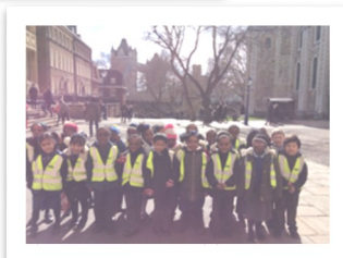
Class R2 at the Tower of London