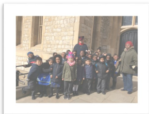
Class R1 with a Beefeater

Class R1 & R2 had a great day at the Tower of London. They saw the Crown Jewels and the historic Beefeaters and Ravens. Thank you to all the Parents and Carers who helped on both days.